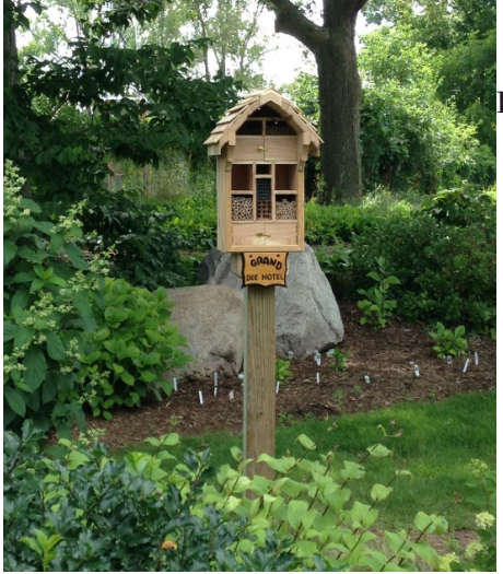
Photo: Pollinator information and the Grand Bee Hotel featured in the MSUE Grand Ideas Garden

Through Smart Gardening seminars and conferences, as well as the Grand Rapids Home and Garden Show, Finneran reached over 1,000 people with Pollinator Protection education. In addition, she produced an educational youtube video entitled "Smart Gardening for Pollinators" which has over 4,000 views.